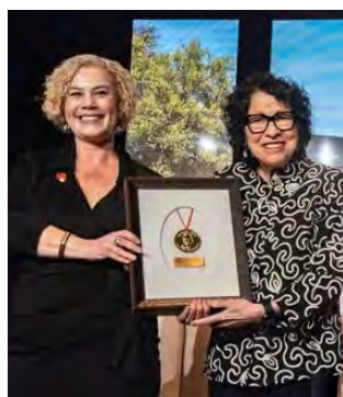
2025 UofL Brandeis Medal presentation to U.S. Supreme Court Justice Sonia Sotomayor.

The University of Louisville Louis D. Brandeis School of Law presented the Brandeis Medal to U.S. Supreme Court Justice Sonia Sotomayor on Feb. 5. The Brandeis Medal honors recipients for their devotion to economic, social or political justice and for advancing the cause of public service in the legal profession. Sotomayor is the seventh Supreme Court justice honored with the medal, following Harry Blackmun, Stephen Breyer, Ruth Bader Ginsburg, Elena Kagan, Sandra Day O'Connor and John Paul Stevens.